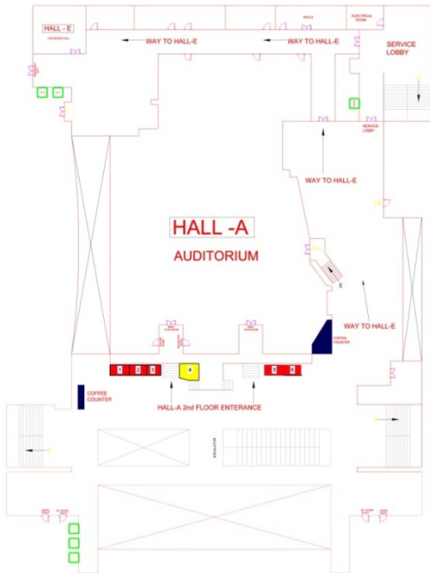
KALAIVANAR ARANGAM SECOND FLOOR